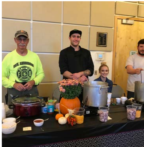
2nd Place: MLFD Volunteers