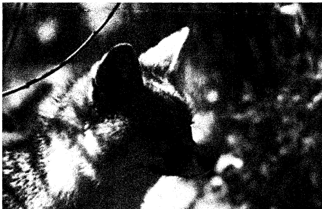
Aspen in Prescott