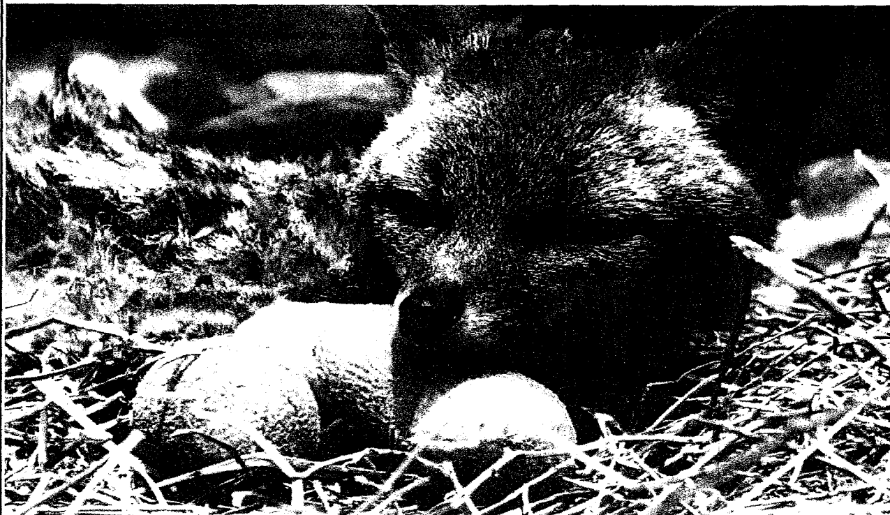
Aspen the Fox during recovery