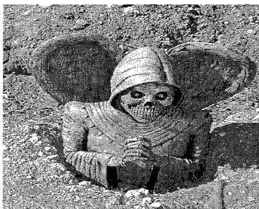
Grave Yard Spirits