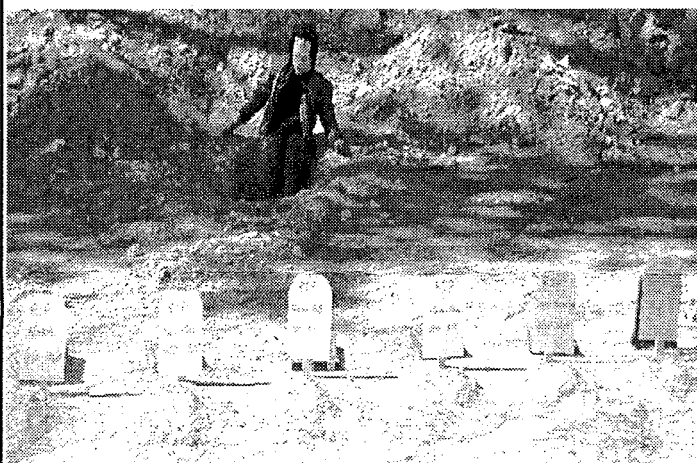
Frankenstein, the grave robber

Dolly the Witch brewed a batch of her Nasty bad bean chili but it was so bad the witch's cauldron would not stop jumping around and Miss Kitty had a litter of 160 kittens so they were put up for adoption..