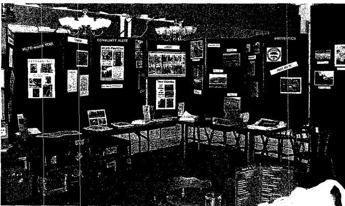
FireWise and NeighborWise Display Boards at the MLHOA Dinner

Now on to my favorite subject. We will be having a potluck dinner at the Firehouse on June 22nd at noon. During