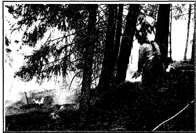
Fire on Red Ridge 3/16

Trico Electric has scheduled their Annual meeting for May the 4 th at 8600 W Tangerine Road starting at 9 AM. Read the Trico Livewire for more information!