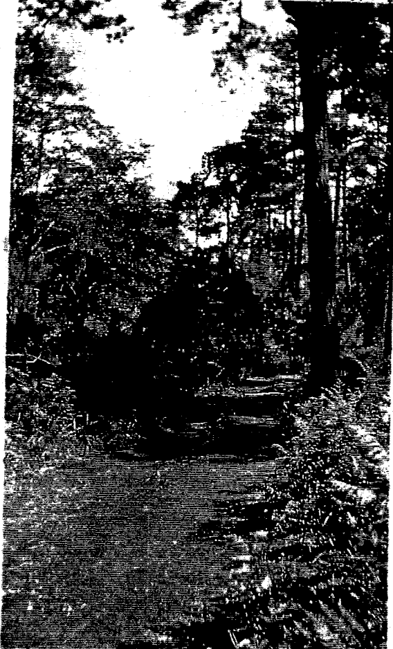
Main Street Summer haven