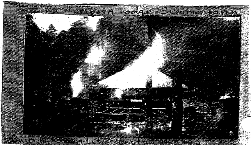
Built by the Mt. Lemmon Homeowner's Association