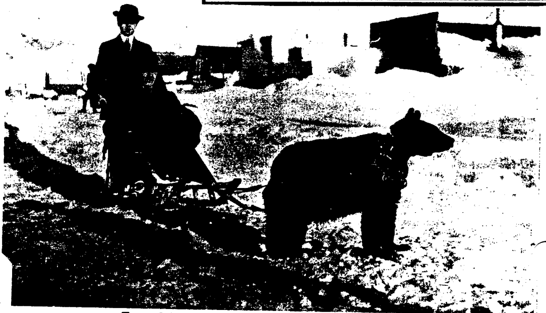
Turn of the century in Valdez, several residents kept black bears as pets. the tame bears could be seen sleeping on porches and pulling sleds in the winter along McKinley St.