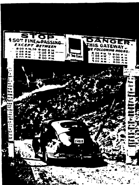
Photo of Control Road at Stratton Mine