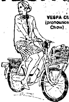
VESPA CIAO (pronounced Chow)

You get 168 miles per gallon from a Vespa Ciao. Pedal it like a bike for exercise. Or enjoy the motor for shopping. The Ciao has automatic transmission and is whisper-quiet. Weighs just 74 pounds.